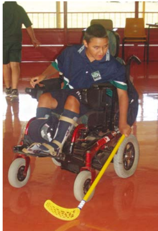
Above: Boy's Group activities at Corinda.

One of the most successful programmes run by the Recreation Department are group activities. Over the past few years, after school group activities have more than doubled due to their popularity and ability to meet client's needs for social and