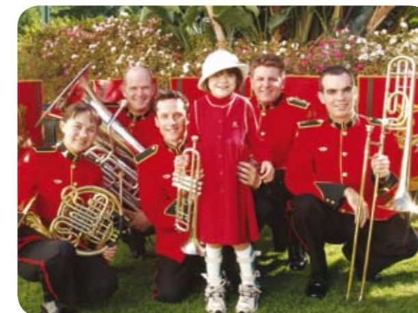
Left: Government House hosted an afternoon in the gardens for MontroseAccess families.