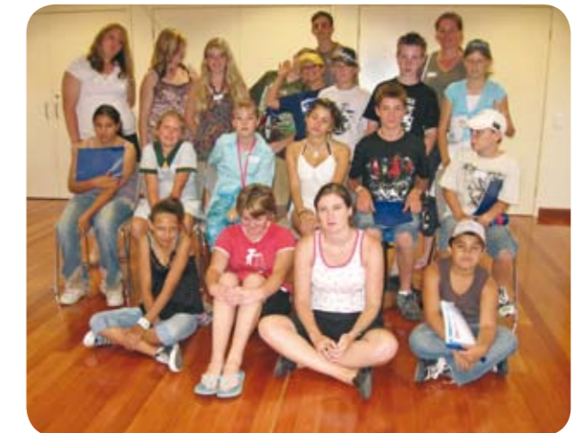
Above: Recreation activities during school holidays.

Social Work activities addressed identified goals and, as many siblings have attended continually for a number of years, the programme has been adapted as they grow and develop.