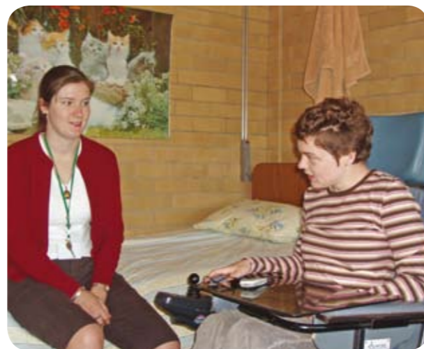
Above: Out-of-home respite.