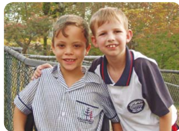
Above: MontroseAccess provides an opportunity for children with disabilities to form friendships with other children.

In addition, the organisation has formal and informal programmes to ensure that long-standing expert staff members assist with mentoring and developing less experienced and graduate staff, ensuring the long-term transfer of specialised knowledge.