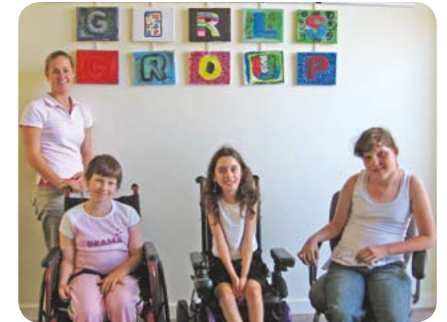
Above: Gold Coast Girl's Group.

The Outreach teams continue to prioritise children with neuromuscular conditions exacerbated by the existing unmet needs of some children in areas without local service providers.