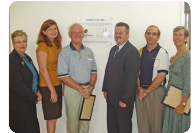
Above: The official opening of Parent Flat Two.

MONTROSEACCESS PARENT FLATS PROVIDE WHEELCHAIR-FRIENDLY AND COMFORTABLE ACCOMMODATION AT A MINIMAL COST FOR CLIENTS AND THEIR FAMILIES.