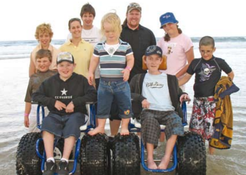
Above: Camps at the Gold Coast provide a perfect beach afternoon.

THE OUTREACH TEAMS CONTINUE TO PRIORITISE CHILDREN WITH NEUROMUSCULAR CONDITIONS EXACERBATED BY THE EXISTING UNMET NEEDS OF SOME CHILDREN IN AREAS WITHOUT LOCAL SERVICE PROVIDERS.