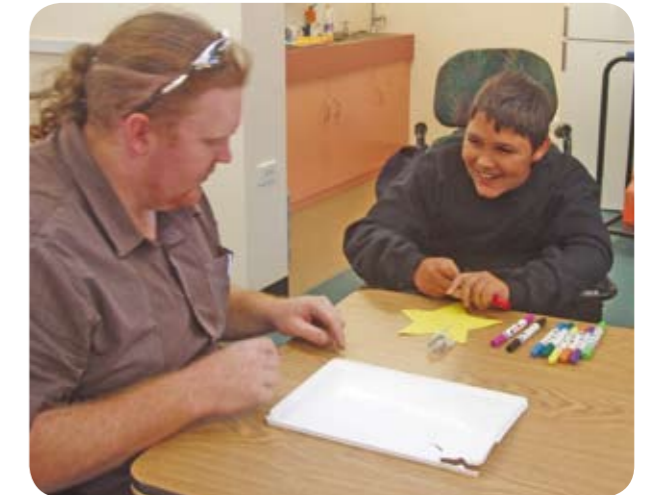
Above: Recreation provides activities for all to enjoy.

MontroseAccess continues to respond to the demographic changes occurring in Queensland with the inner city teams experiencing a reduction in caseload numbers but fringe suburbs and regional and rural teams coping with increased referrals. To cope with this change, team boundaries have been adjusted and hours have been reallocated to teams where the need is highest. Areas of highest need continue to be the Sunshine Coast, the suburbs on the northern outskirts of Brisbane and regional and rural Queensland.