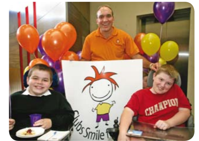
Above: MontroseAccess clients participated in the Clubs Queensland 'Clubs Smile for a Child' programme.