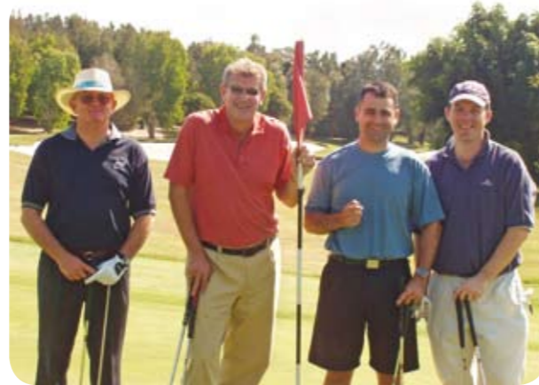
Above: PKF Golfers enjoying the challenge!