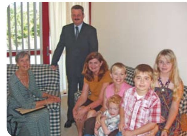
Above: Relaxing in the refurbished Parent Flat Two.

MontroseAccess extends a sincere thank you to the Gambling Community Benefit Fund, who kindly donated the funds to refurbish the flat. We would also like to thank our own Backyard Blitz team: Solver Paints — who donated the paint, and the Rotary Club of Rocklea, who volunteered their painting and renovation skills!