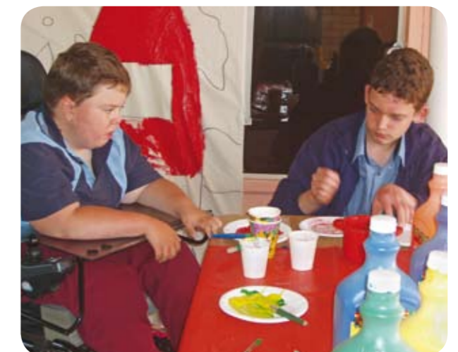
Above: All ages are catered for during Boy's Group.

EQUIPMENT FOR TREATMENT AND TO LEND TO FAMILIES IS ESSENTIAL FOR CHILDREN WITH DISABILITIES. MONTROSEACCESS CONTINUES TO MAKE DIRECT LOANS TO FAMILIES AT NO COST.