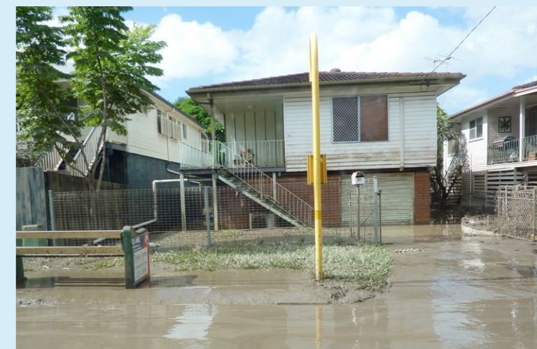
As the waters recede, the tell tale signs of how high up the waters rose still remain on this house at Oxley