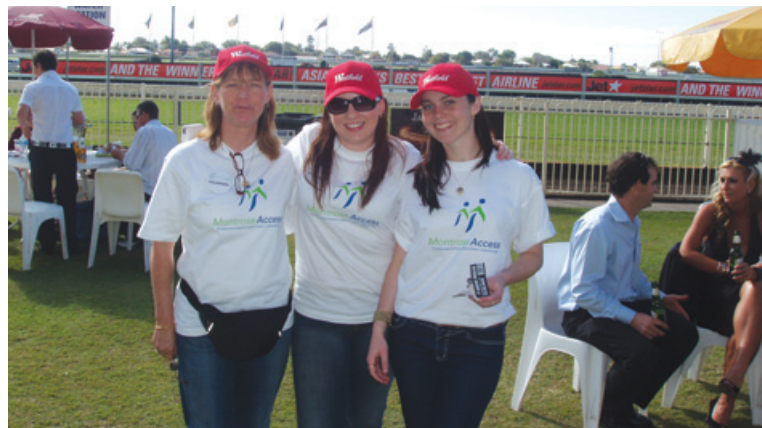
Volunteers from Westfield were a tremendous help at our Race Day

A very big thank you to the generous sponsors of the event: Ownit Homes, BDO Kendalls, Greg Grant Saddlery, Markinson, Ray White, Optimum Recruitment and Trilby Misso; and also to our enthusiastic team of on-course volunteers for making it such a successful day. We couldn't have done it without you!