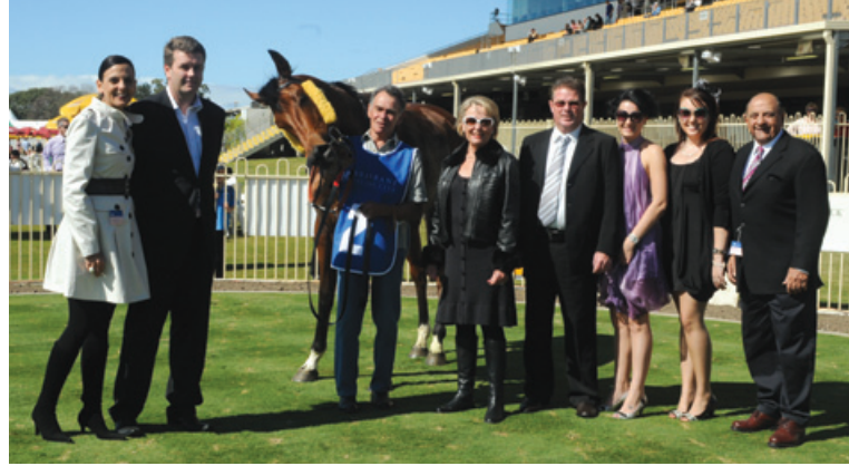
The crew from Ownit Homes meets one of the winning horses