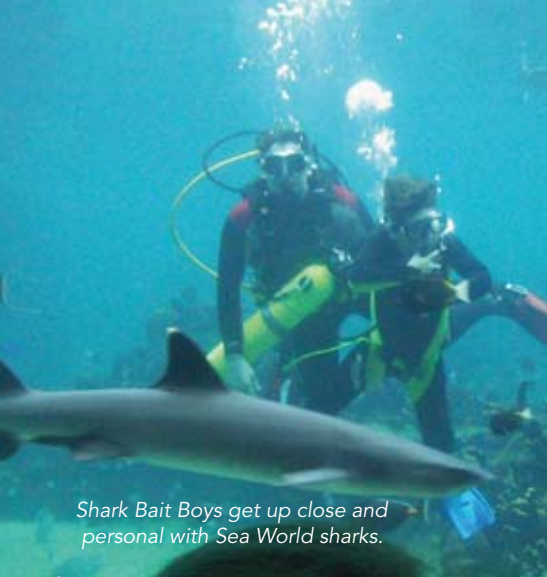
Shark Bait Boys get up close and personal with Sea World sharks.