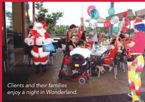
Clients and their families enjoy a night in Wonderland.

A special thank you goes to Westfield for their continued support of MontroseAccess.