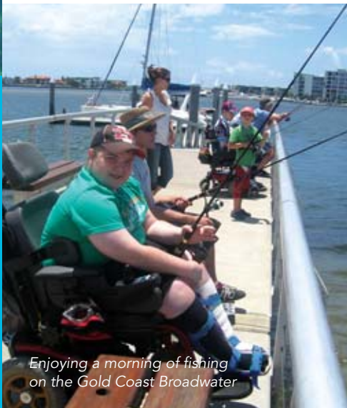
Enjoying a morning of fishing on the Gold Coast Broadwater