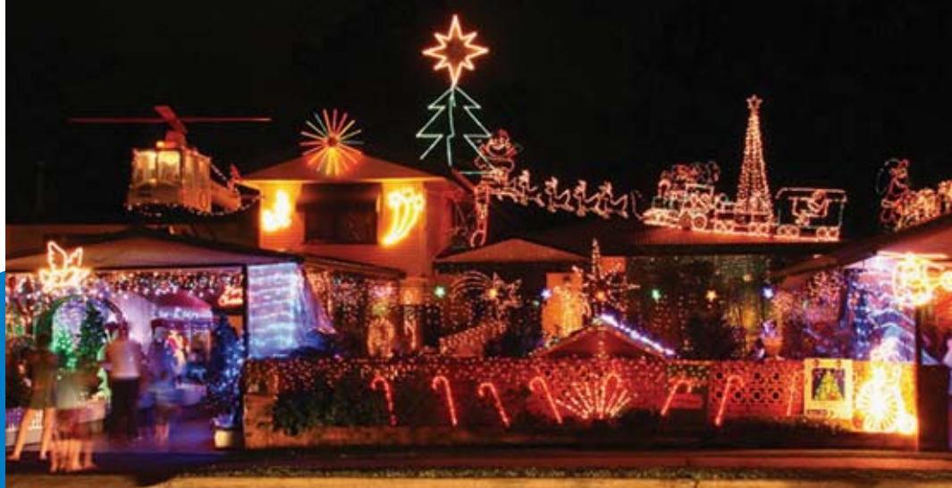
The Allen family lights up Kalinga