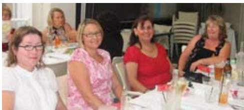
Parents and carers enjoy a well deserved break.

Thank you to CUA for funding this event.