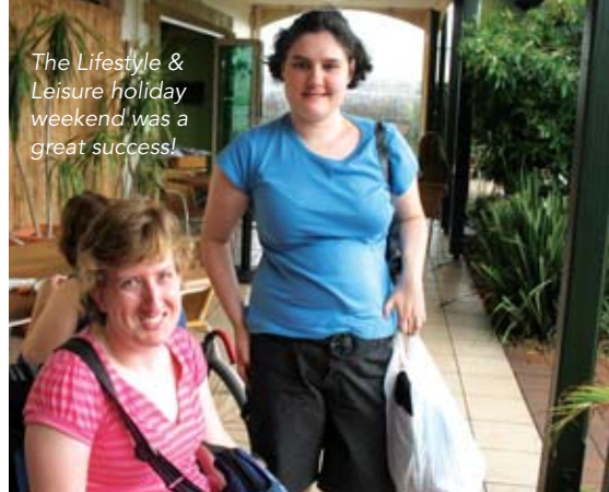
The Lifestyle & Leisure holiday weekend was a great success!